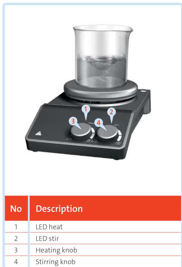
Figure 2. Device's control elements